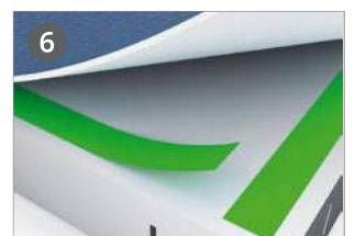
6 Floor finishes Durable installation of various floor lining materials.