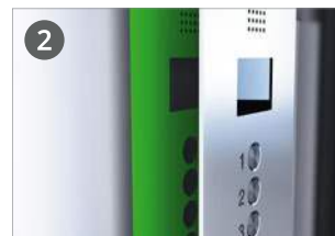
2 Control panel Fast and reliable adhesion to a variety of surfaces, e.g. for touch panel construction, cover panel mounting etc.