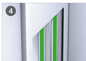
4 Decorative panels Permanent or temporary bonding solutions for all types of decorative panels.

Orafol tapes provide a damage-free and invisible bonding solution for the interior design of elevator cars. This allows for interior retro-fitting over the elevator's lifetime.