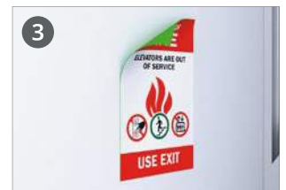
3 Security materials Permanent and non-removable fastening of printed label material to a variety of surfaces.