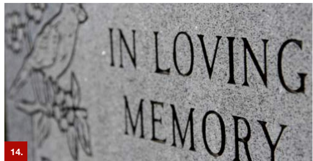
Example 14 ORAMASK® 831 / 832