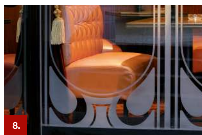
Example 8 ORACAL® 8810