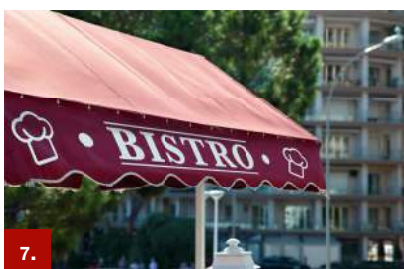
Example 7 ORACAL® 451

The typical use of the new diffuser films is application inside light box displays, where they will ensure evenly distribution of the light, as well as prevent unwanted external visibility of the internal light sources. They provide an easy means of getting a perfect finished look to any internally lit display, and are designed for use with both LED and general light sources. The materials come in two different light transmission grades.