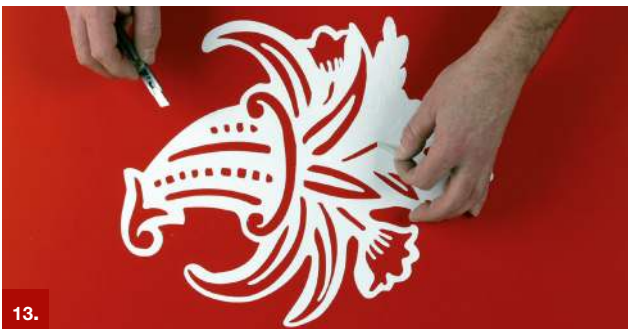
Example 13 ORAMASK® 810

These special purpose PVC films which are 230 and 350 micron thick are designed for a wide range of applications in stonemasonry and artistic sandblasting studios. They are ideal for sandblasting of glass, plastics and wood.