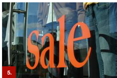
Example 5 ORACAL® 641