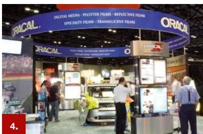
Example 4 ORACAL® 631

This plotter film is constructed specifically for use on banners, ribbons and other flexible surfaces. It adapts well to any surface, remains stable even under demanding conditions and may be easily removed without any trace. Possibilities are endless with a colour range of no less than 23 standard options.