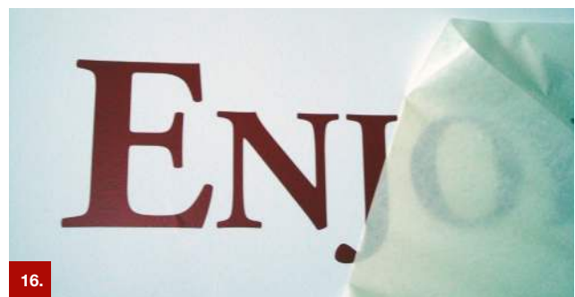
Example 16 ORATAPE® LT52