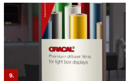
Example 9 ORACAL® 8830