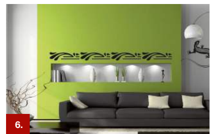
Example 6 ORACAL® 638