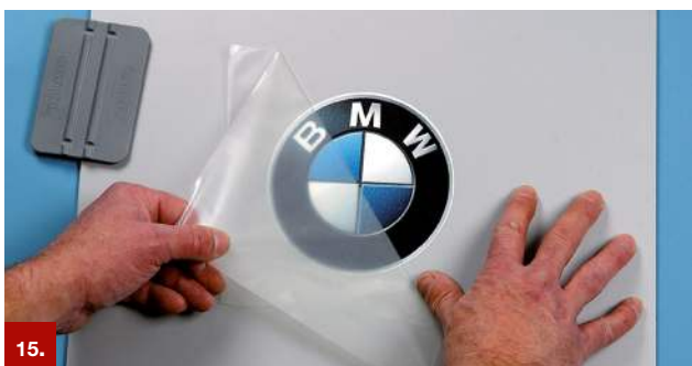
Example 15 ORATAPE® MT95

ORAFOL has developed application materials for a great variety of demands and uses.