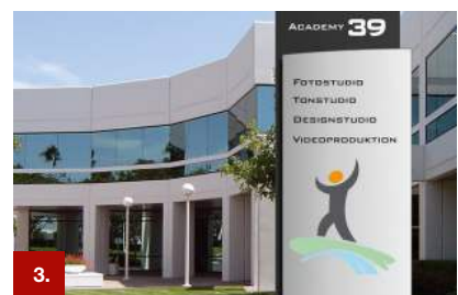
Example 2 ORACAL® 751C