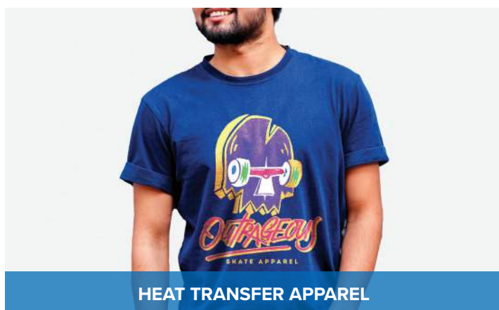
HEAT TRANSFER APPAREL