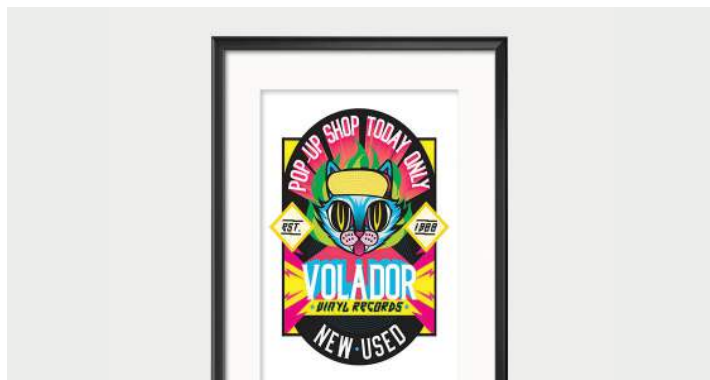
SIGNS AND POSTERS